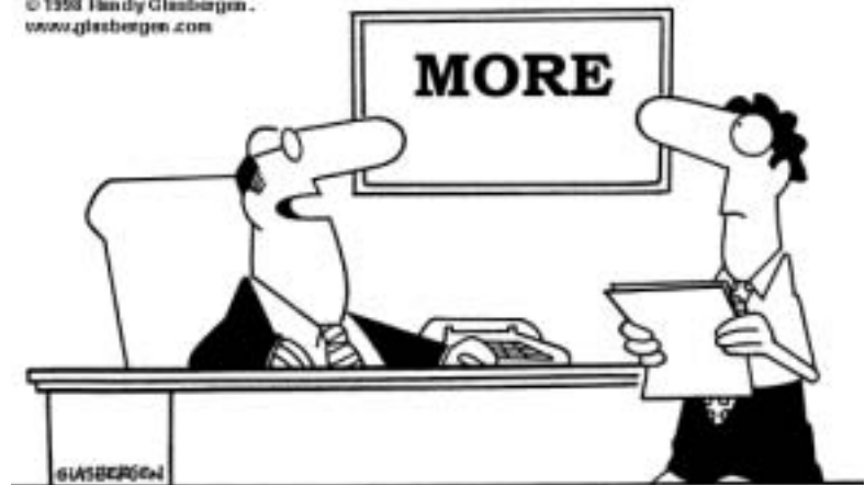
"That's our new mission statement."