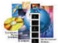
Image Filing Systems Division Authorized Full-Service Dealer Network